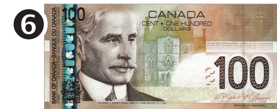
Can$100 Dollars = $73.91 U.S. Dollars