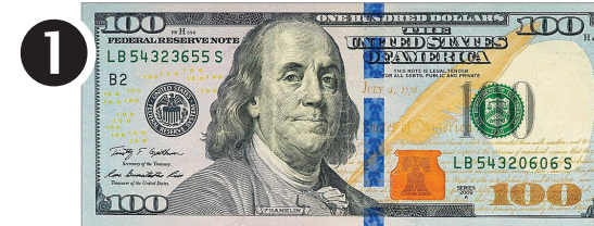
$100 U.S. Dollars