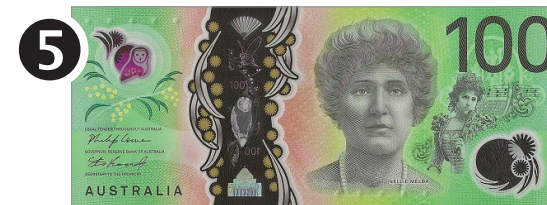
AU$100 Dollars = $69.13 U.S. Dollars