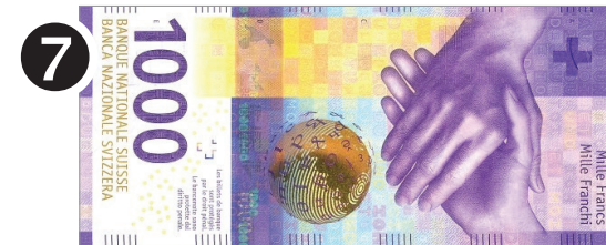
₣1,000 Francs = $1,180.66 U.S. Dollars