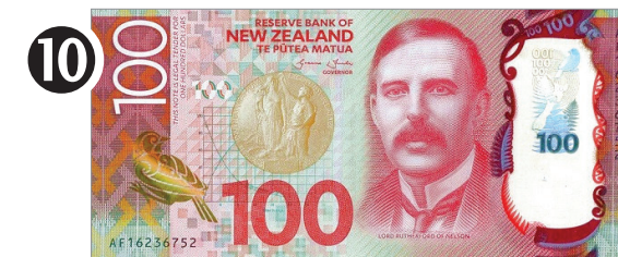
NZ$100 Dollars = $63.45 U.S. Dollars

*The values were taken as of September 30, 2024.