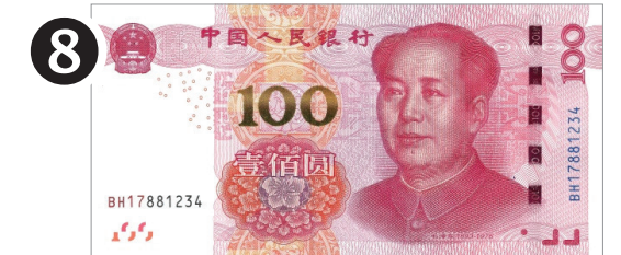
CN¥100 Yuan = $14.25 U.S. Dollars