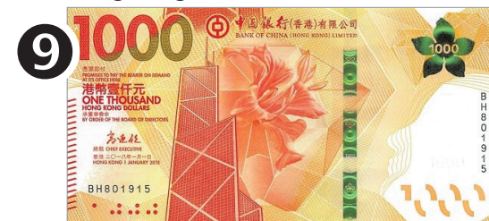
HK$1,000 Dollars = $128.63 U.S. Dollars