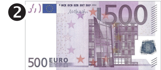
€500 Euros = $556.10 U.S. Dollars