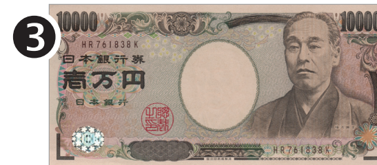
¥10,000 Yen = $69.59 U.S. Dollars