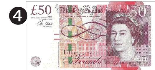
£50 Pound Sterling = $66.90 U.S. Dollars